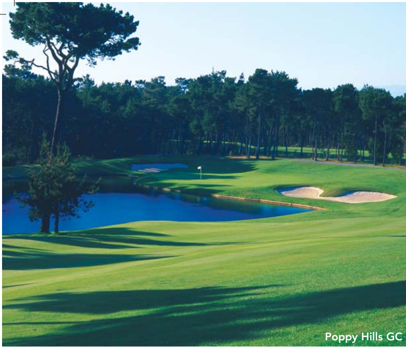
Poppy Hills GC

Join the Northern California Golf Association and enjoy access to discounted, world-class golf and free lessons, help grow the game and receive many other tangible benefits. The NCGA provides services to approximately 400 regular clubs and more than 850 associate clubs, totaling nearly 175,000 members, and serves as a resource for all things golf in the region.